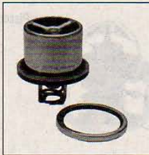
Seal Part No. 33601